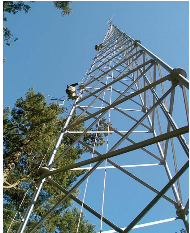
With the wind generator installation complete, it's time to begin installing the PVs.

Finally, we decided on a tower—a triangular-based, 160-foot-tall Eiffel Tower-style manufactured by Glen Martin Engineering. It was designed to handle a much larger wind generator and a larger PV array than we initially planned, so we could grow the system as we used our property more