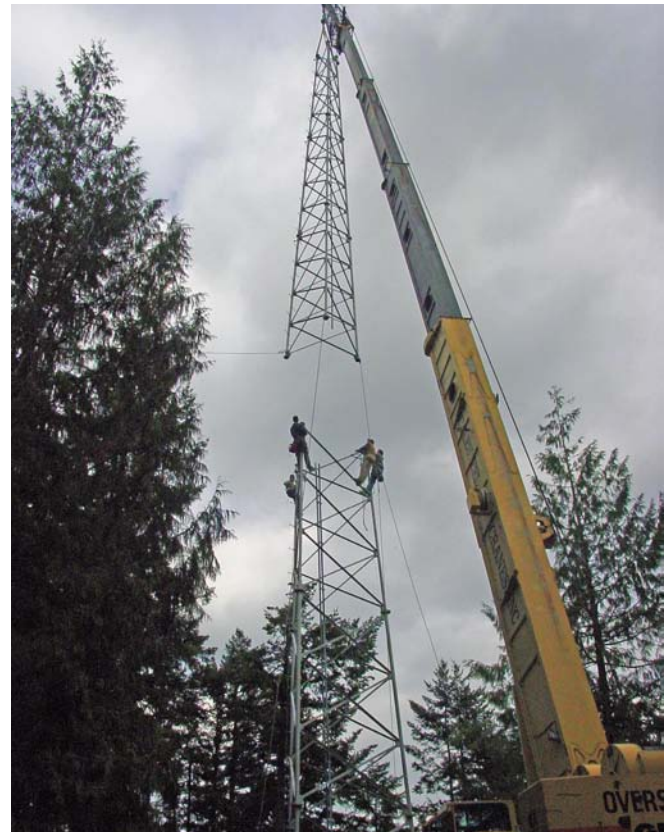
The crew at the top of the tower's first section gets ready to receive and bolt the second section into place.

The property had no utilities, so after building a road and digging a well, we turned our focus to getting electricity. Until we had some form of reliable electricity in place, we would not be ready to build our house.