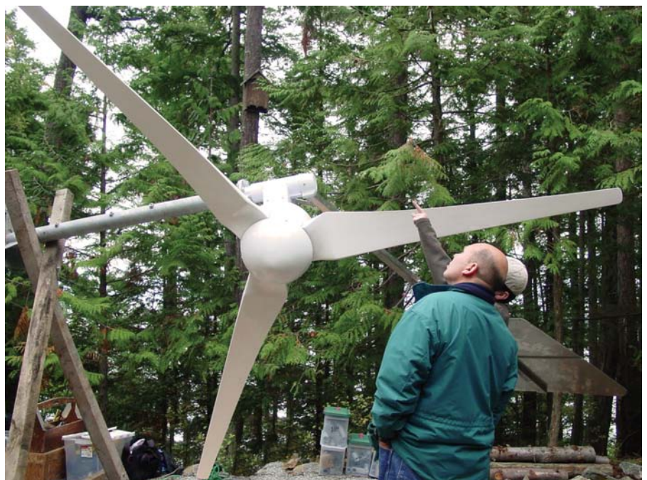
The complete AWP wind turbine was bolted to the tower's top section prior to lift.

The choice of wind turbine and PV panels took a backseat to the most important element—the tower. If we didn't get the components up into the sun and wind, energy generation was not going to happen. Major considerations