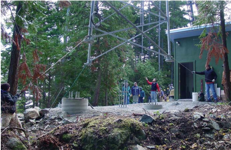
A 50-ton crane lifted each assembled tower section into place. Amazingly enough, the first section lined up perfectly with the column bolts set into the concrete.

There was no moment of epiphany or assurance of how simple it would be to use renewables. Cutting down trees seemed to be inevitable to get any solar panels into the sunlight. Ian suggested wind power. At that time, I did not understand the perfect synergy of a PV-wind hybrid system, but in our rainy, northern, marine climate, sun and wind have an amazing reciprocal relationship. Our hillside site made us feel sheltered from the prevailing winds, but Ian thought wind was a good potential energy source for us. And, he said, once we built a tower to get the wind turbine above the trees, mounting a PV array on the south side of the tower could give us a viable hybrid system.